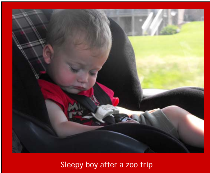
Sleepy boy after a zoo trip